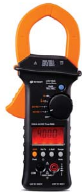
U1210 series Clamp Meters