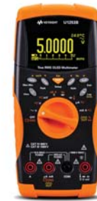
U1250 series Digital Multimeters