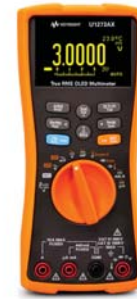
U1270 series Digital Multimeters