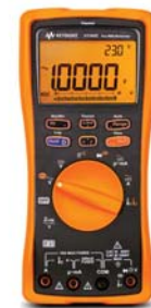
U1240C series Digital Multimeters