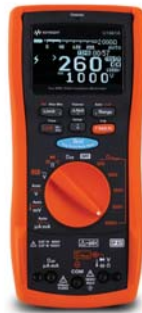
U1450/60 series Insulation Resistance Testers