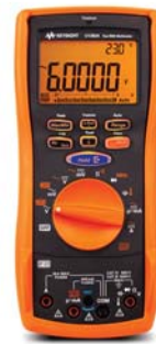
U1280 series Digital Multimeters