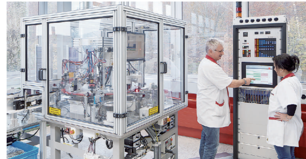
Fully automated assembly with a human touch

The individual adaptability of our components means that small as well as more major customizations can be carried out directly by EAO. We can also offer customized innovations based on standard components, with subsequent serial production. Meeting the requirements of our customers and the needs of end-users is what we do best.