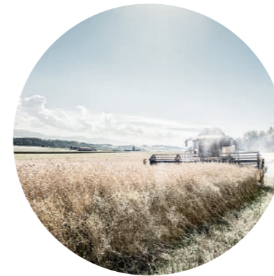
Heavy Duty & Special Vehicles

Virtually no other market combines technology, design, and safety to such a high standard as the automotive industry. Such complexity provides the sort of challenge we relish. Innovative and reliable technology paired with customer-specific functionality are what characterize our sensor-controlled, electronic, and electromechanical control elements. As a globally certified partner to major automotive manufacturers and suppliers, we impress our customers with the excellent quality of our products and services.