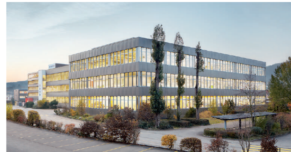
EAO Headquarters Olten, Switzerland

We act responsibly. In our ecological focus, we set benchmarks for ourselves, our products, and our customers. Our purchasing, manufacturing, and logistics operations are carried out in a manner that conserves resources and which is environmentally friendly. When selecting our components and materials, we ensure that we have partnerships in place with certified manufacturers and that we adhere to EC guidelines on hazardous materials (RoHS). We view continuous monitoring and optimization procedures at all levels as a vital part of our commitment to protecting the environment.