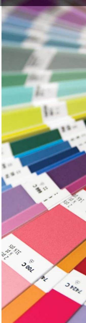
Special Materials and Custom Colors