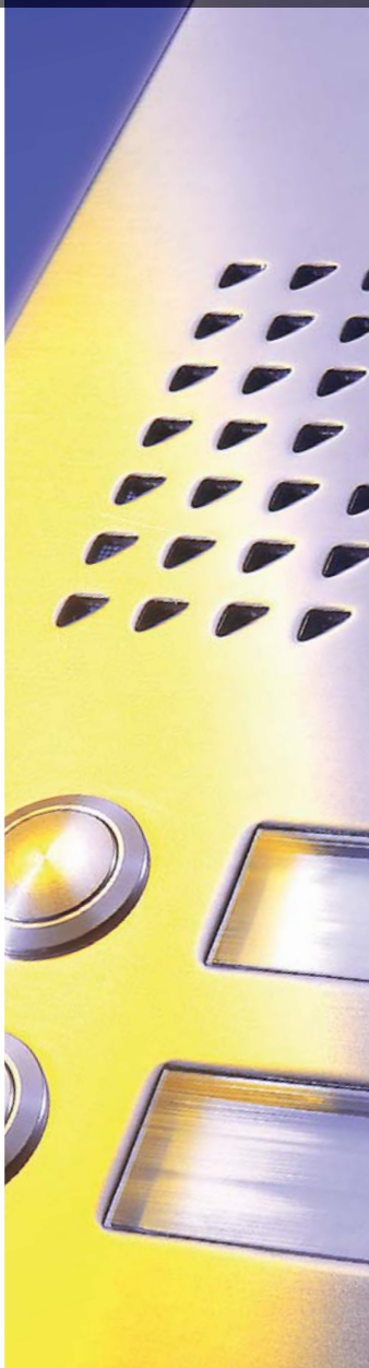
Basic Panel Assemblies