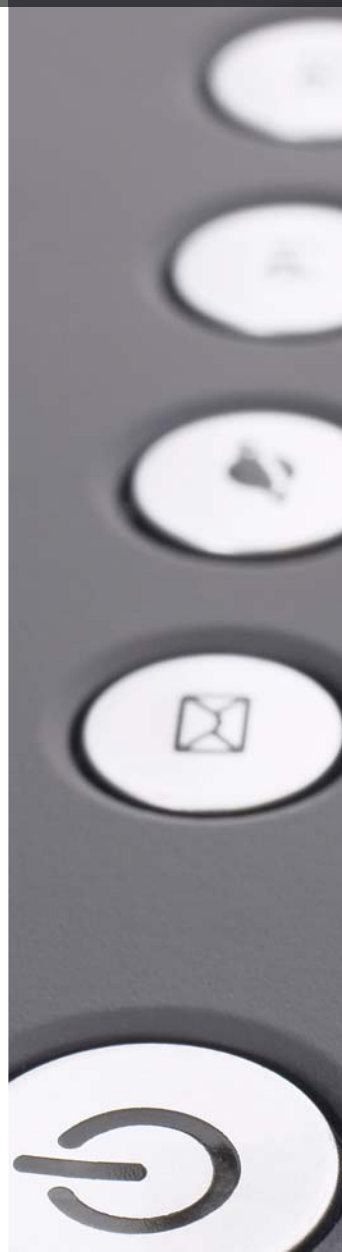
Laser Etchings, Custom Caps and Special Markings